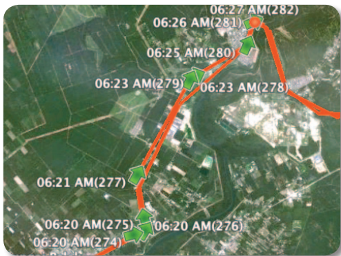
Route History - Tracking detailed movement of vehicle on Google Earth