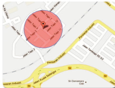
Pre-defined location in Geo Fence to track when vehicle enters or exits specific area